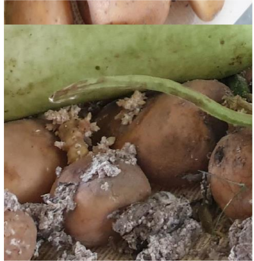
Rearing of pests in Biological lab