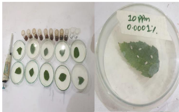
Pests treated with extracted Bio pesticide