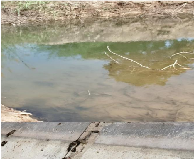
Site for Sample collection