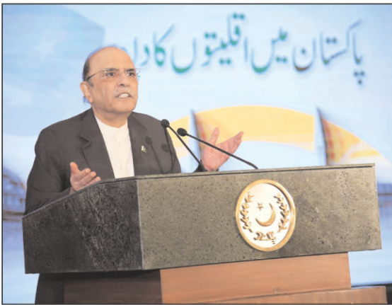
President Asif Ali Zardari addressing a ceremony in connection with Minorities' Day in Pakistan, at Aiwan-e-Sadr, Islamabad.

The former PM and others were accused of illegally appointing a former managing director of PSO, misuse of authority, and causing losses to the national exchequer, in a supplementary reference filed in 2020 with the LNG terminal case. An accountability court in Karachi acquitted Abbasi and others in the LNG case in April this year.