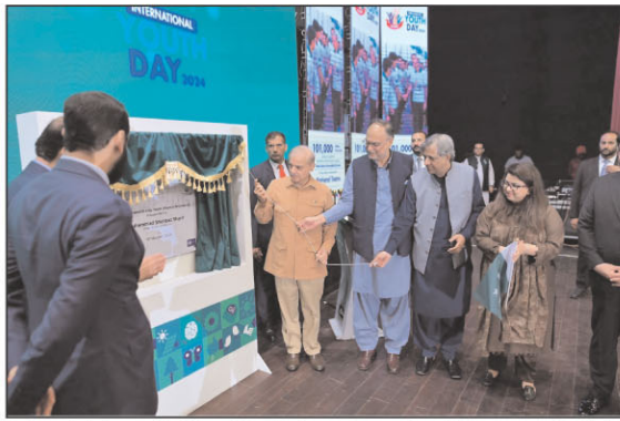
Prime Minister Shehbaz Sharif inaugurates the Commonwealth Asia Youth Alliance Secretariat, at the International Youth Day ceremony in Islamabad.