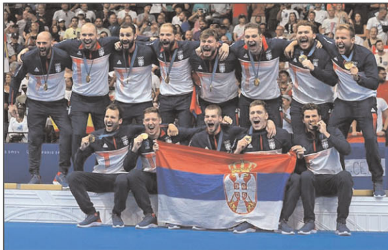
Serbia make it three water polo Olympic crowns in a row

"We went through it all in this tournament, from right down to up. I really can't believe that the dream has come true," he said.