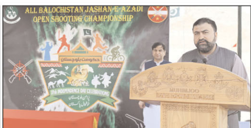
CM Sarfraz Bugti addressing during concluding ceremony of All Balochistan Independence Day Shooting Championship on Monday.