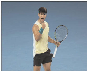
Alcaraz sets sights on year-end number one spot

"Tell me any other sport on the opening day of a competition is celebrating a medal for Ecuador, so that for me tells me the sport is moving in the right direction," Coe said.