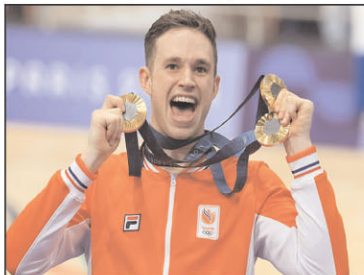
Hat-trick Harrie becomes most successful Dutch summer Olympian

Djokovic withdrew from Cincinnati after his Olympic triumph.