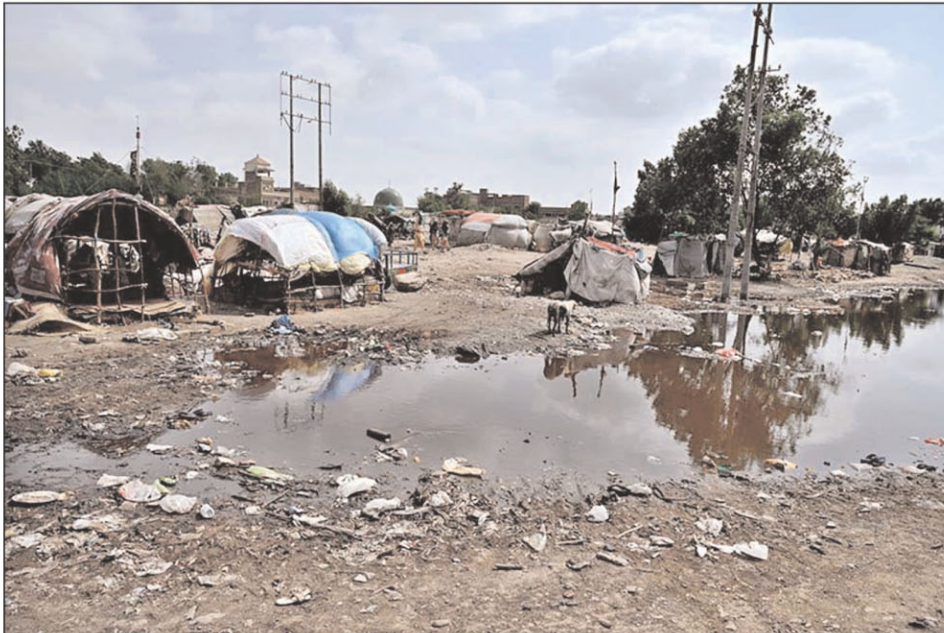
HYDERABAD: A view of rain water accumulated front of huts at Makki shah area.

Scientists also fed the mice a matching designer drug. This resulted in an increase in neprilysin production and decreased levels of free-floating beta-amyloid.-Online