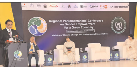
Speaker National Assembly, Sardar Ayaz Sadiq delivering key note address to the participants of the Regional meeting on 'Gender Empowerment and Green Economy'.

SSGC's Managing Director, Imran Maniar, inaugurated the pipeline, underscoring that the project will separate low-pressure domestic and commercial consumers from high-pressure industrial consumers in the SITE and Hub Industrial Areas. This new pipeline is expected to meet approximately 269 mmscf of demand.