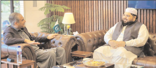
Federal Minister Interior Mohsin Naqvi in a meeting with JUP Secretary General Owais Noonari.

Continued from page 1 hearing, petitioner Guharam Bagni spoke to the media, saying they seek justice from the court. He requested biometric verification, asserting that the truth would be clear after the biometric process. If justice is not served, they will file an appeal in the Supreme Court.